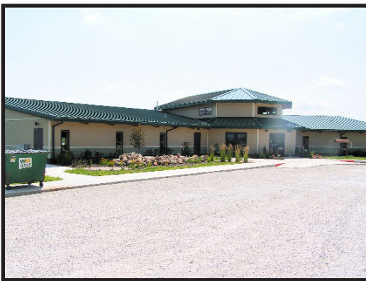
Water's Edge Nature Center